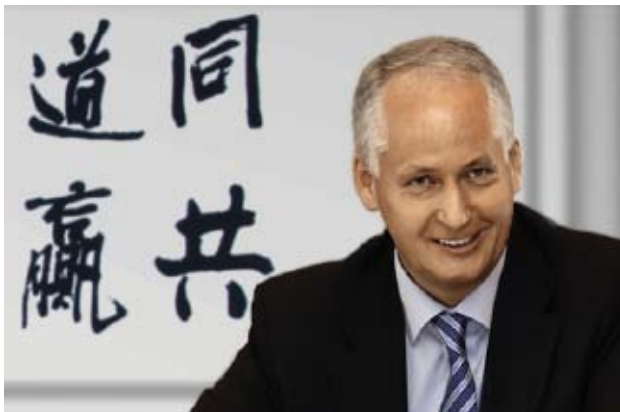
Hubertus Troska | 53 , Greater China Appointed until December 2015