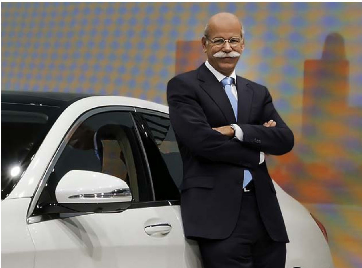
Dieter Zetsche | 60 , Chairman of the Board of Management, Head of Mercedes-Benz Cars Appointed until December 2016